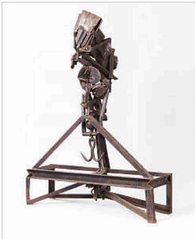
Museum of Modern Art

The Lifted X , 1965, was acquired by the Museum of Modern Art in New York last year.