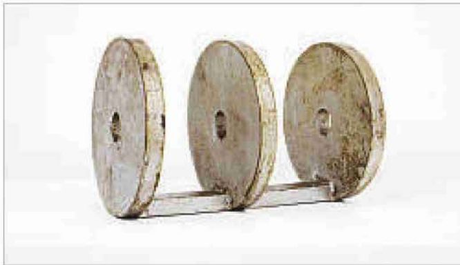
Stephen Friedman Gallery,