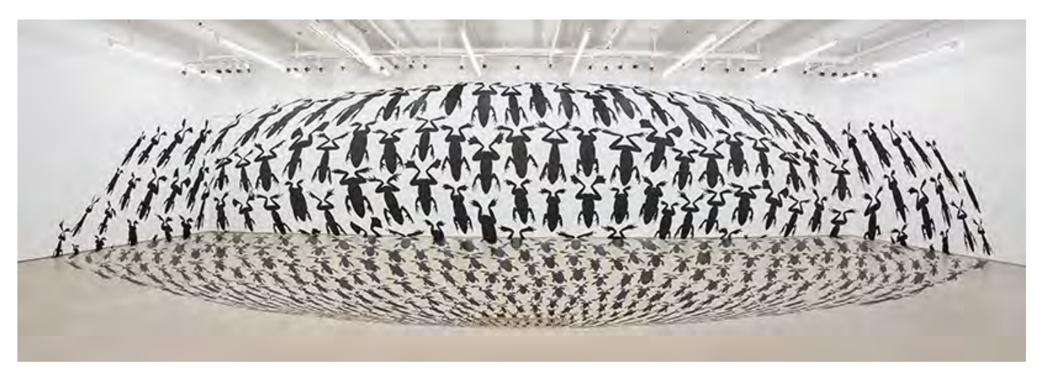
'amphibia' covers the walls and floor of the new york gallery

artist regina silveira has realized a room-sized, mixed media installation at new york's alexander gray associates — transforming the perception of space through minimal intervention. the site-specific 'amphibia' covers the walls and floor of the gallery's second floor with a graphic sequence of oversized frogs, the silhouettes of which funnel towards a gilded metal grate in the center of the floor. visitors are drawn into an immersive and experimental setting, where perspective is skewed and the interior space is distorted beyond recognition.