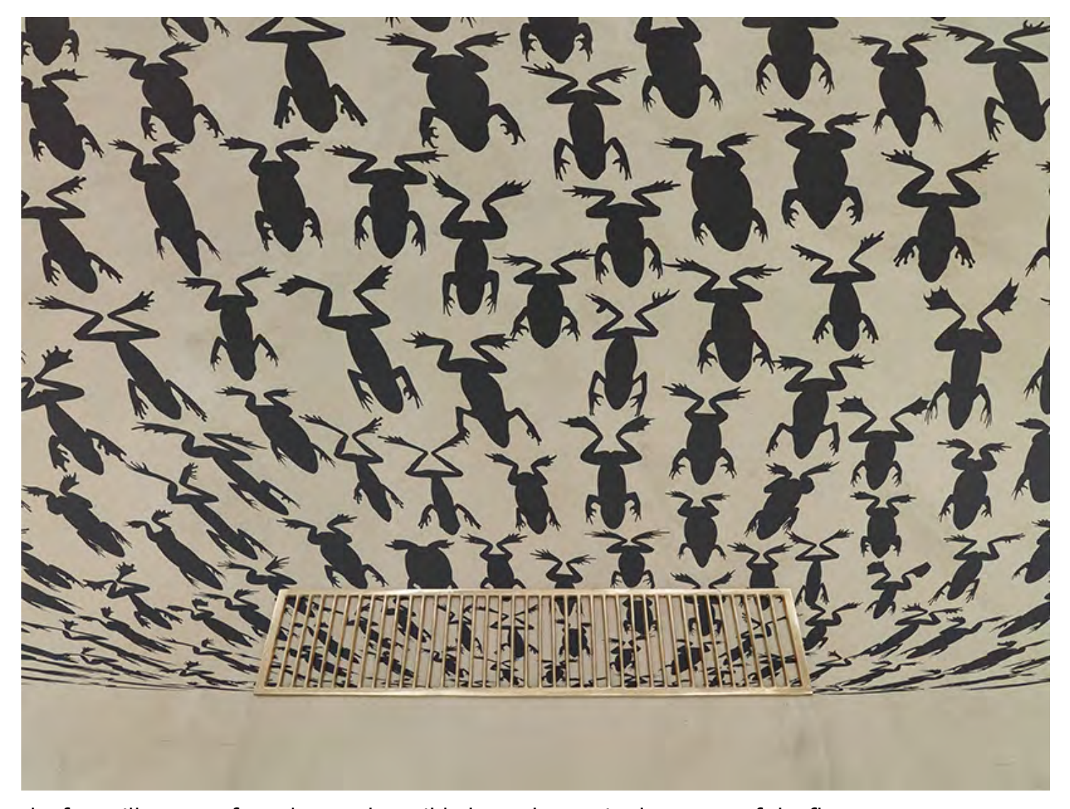
the frog silhouettes funnel towards a gilded metal grate in the center of the floor