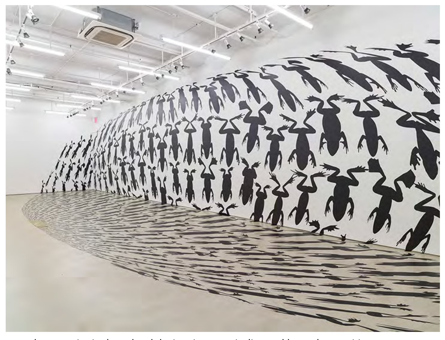
natural perspective is skewed and the interior space is distorted beyond recognition