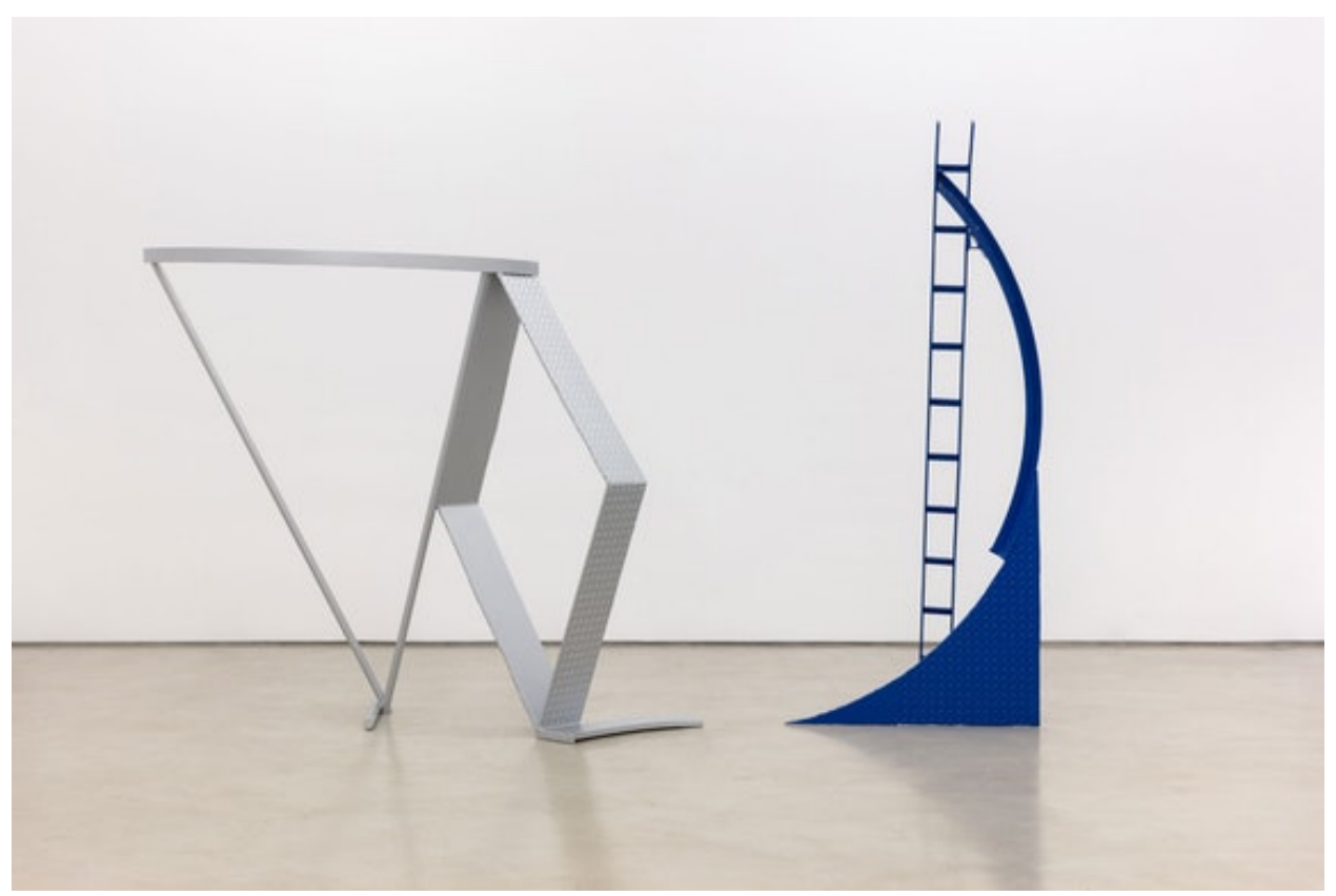
Melvin Edwards, Tan Ton Dyminns , 1974. Painted welded steel in 2 parts, part 1: 84 1/2 x 36 x 37 inches, part 2: 66 3/8 x 78 1/2 x 34 inches. Courtesy Alexander Gray Associates, New York; Stephen Friedman Gallery, London. © Melvin Edwards/Artists Rights Society (ARS), New York.

Edwards: His first, the year I was born, that's the year it was published, 1937. But anyways he was asked—