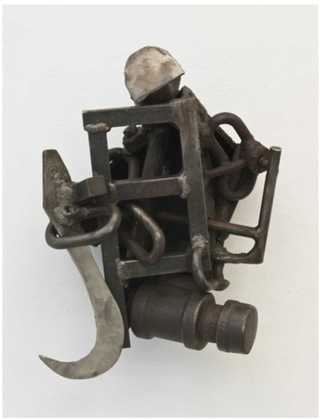
Melvin Edwards, Numanake , 1993. Courtesy the artist and Alexander Gray Associates, New York; Stephen Friedman Gallery, London. © Melvin Edwards/Artists Rights Society (ARS), New York.

Edwards : Most people think if they don't know what it is, it must be abstract. Abstraction is a concept. It's not a singular concept, it's pluralistic in its significance. Abstraction, in its most literal definition, means to take from what exists and create something from it,