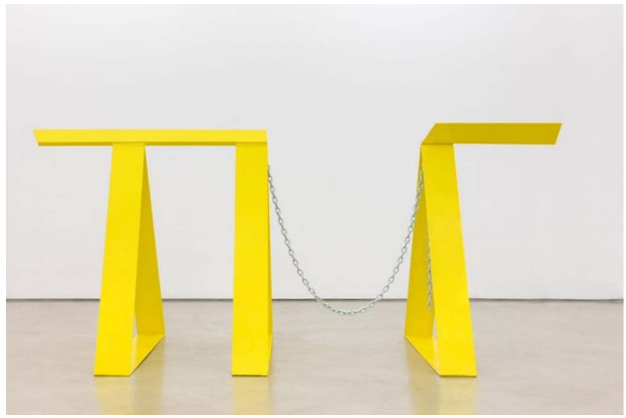
Melvin Edwards, Ntrytry, 1981. Painted welded steel and chain, 57 x 132 x 60 3/4 inches.

Mel Edwards : So ... your accent says you're from where?