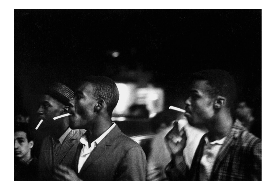
Al Fennar, "Rhythmic Cigarettes, Greenwich Village, New York" (1964)