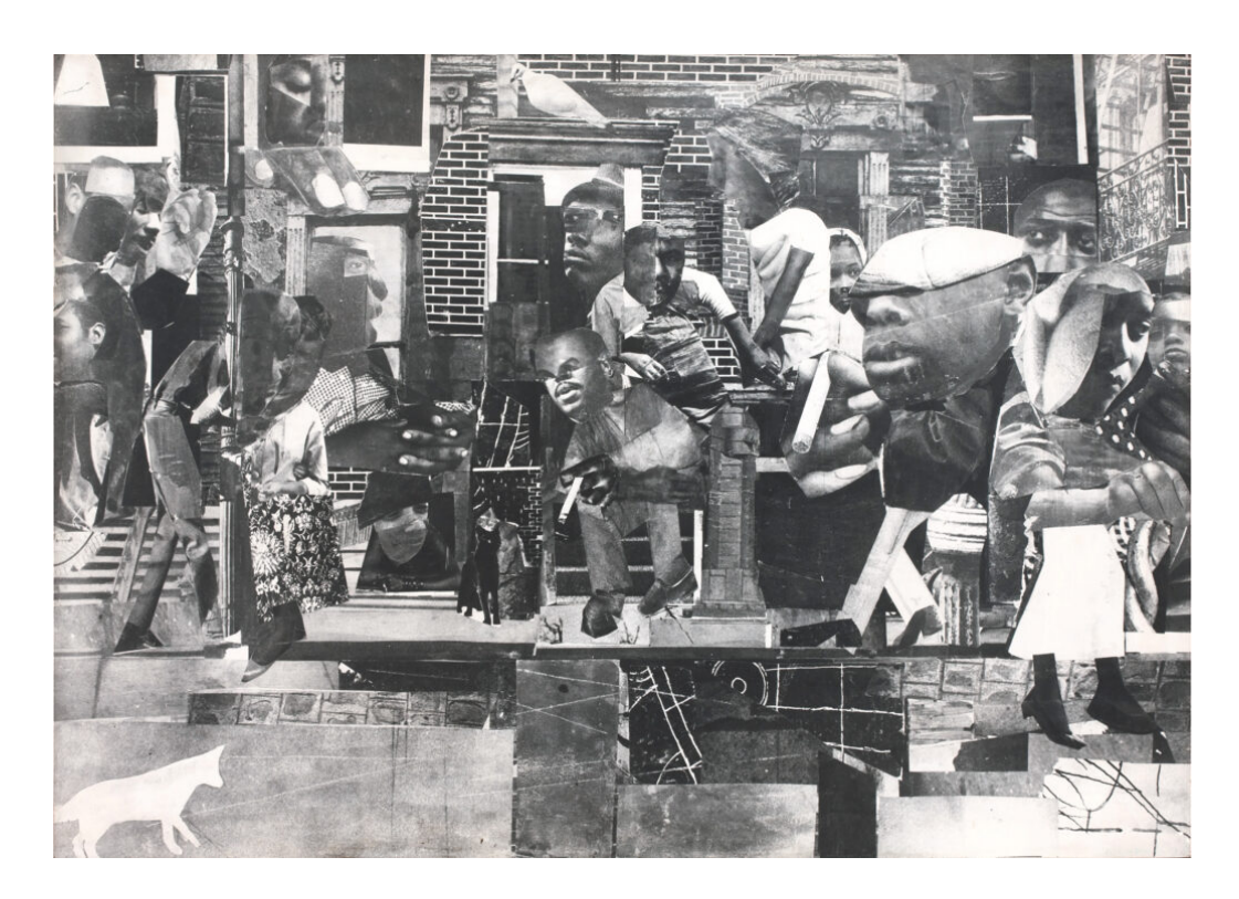
Romare Bearden, "The Dove" (1964)

The metaphor of black power is impossible to miss.