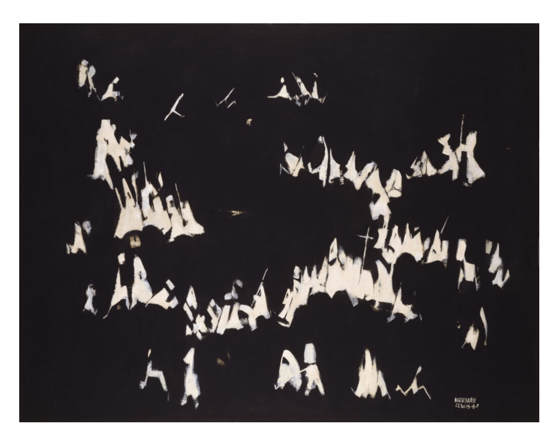
Norman Lewis, "America the Beautiful" (1960)

The de Young presentation of "Soul of a Nation" does suffer from a serious flaw. It is so overcrowded at places that one might question the museum's respect for the art it contains, if we didn't know how assiduously museum staff worked to add San Francisco as a venue at the last minute (along with the Museum of Fine Arts, Houston), after some quick-footed schedule shuffling.