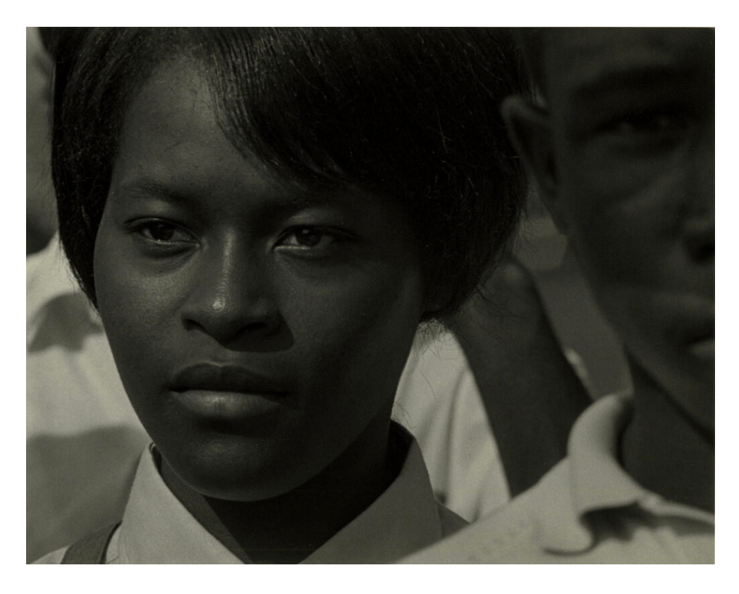
Roy DeCarava, "Mississippi Freedom Marcher, Washington, DC" (1963)

Norman Lewis, known primarily as an abstract artist, painted "America the Beautiful" in 1960. One might almost mistake it for a poetic Abstract Expressionist work, were it not for forms that emerge suggesting flame, crosses and robed personages topped by peaked hoods with rough-cut eye holes.