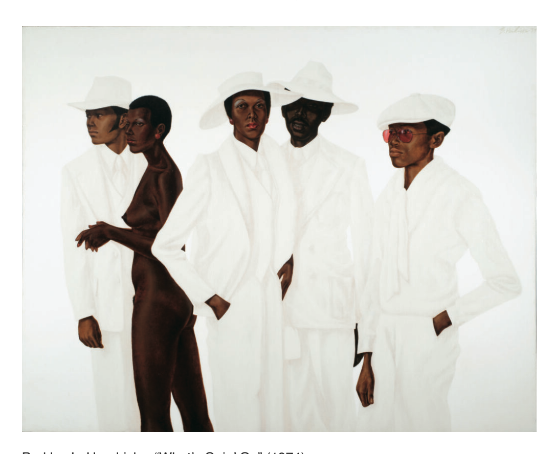
Barkley L. Hendricks, "What's Goin' On" (1974) Photo: © Estate of Barkley L. Hendricks, Jack Shainman Gallery, New York

The latest edition of the catalog for "Soul of a Nation: Art in the Age of Black Power," the blockbuster exhibition that opens Saturday, Nov. 9, at the de Young Museum, features an extraordinary cover image.