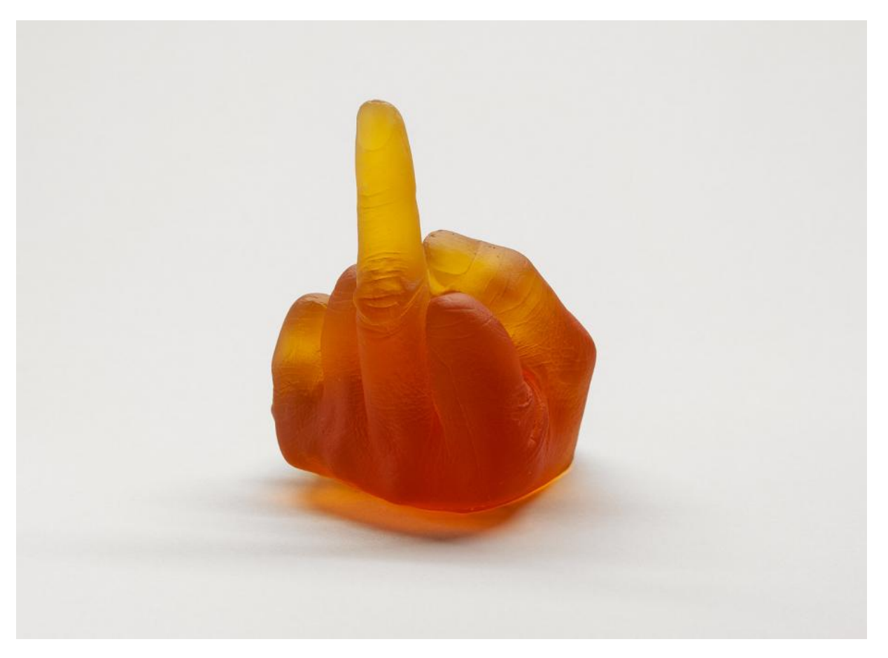
Study of Perspective in Glass (detail), 2018, by Ai Weiwei.