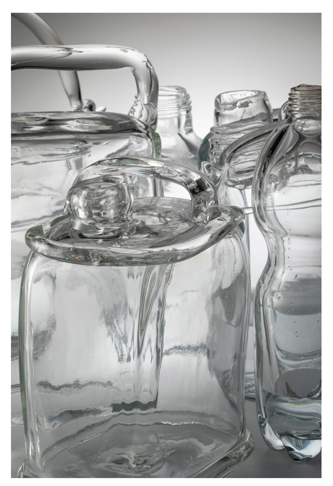
{\it Valeska\ Soares.\ Photography: Allegretto.\ Courtesy\ of\ the\ artist\ and\ Berengo\ Studio}