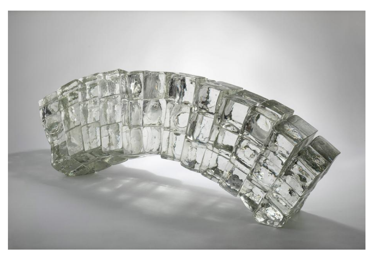
Tony Cragg.