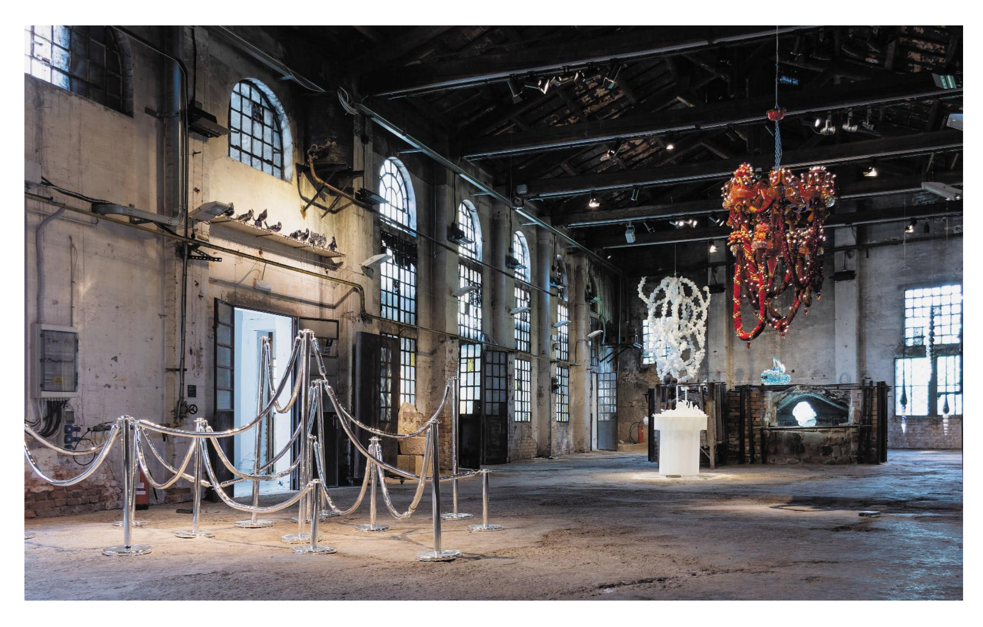
Glasstress 2019, installation view at Fondazione Berengo Art Space, Murano.

Curated by Vik Muniz and Koen Vanmechelen, the sixth edition of Glasstress explores the possibilities of glass through the lens of contemporary art at the 58th Venice Biennale