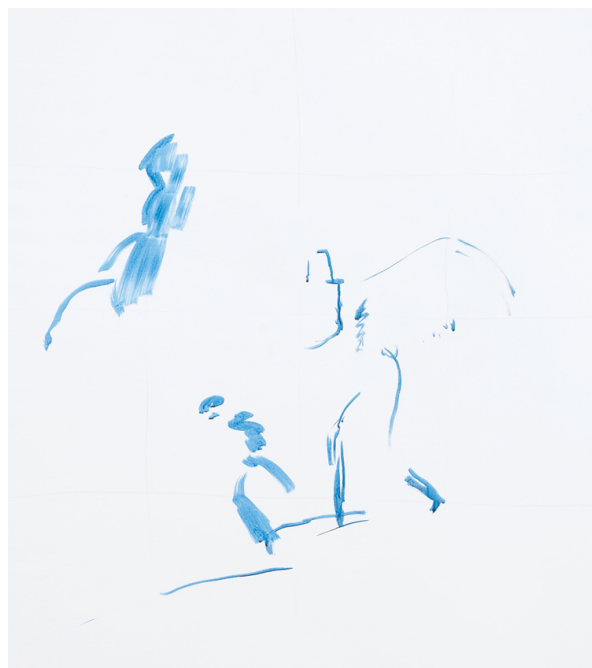
Michael Krebber, Herbes de Provence, Gitanes , 2018, acrylic on canvas, 45 x 40 inches. Greene Naftali.

It's also thrilling to be in the presence of someone I would equate with a master calligrapher. What stuck with me long after I saw the show was the contrast between my impression when I first walked into the gallery and my feeling when I departed: What at first appeared to be faded works that had been pulled into the background later seemed thrust aggressively forward.