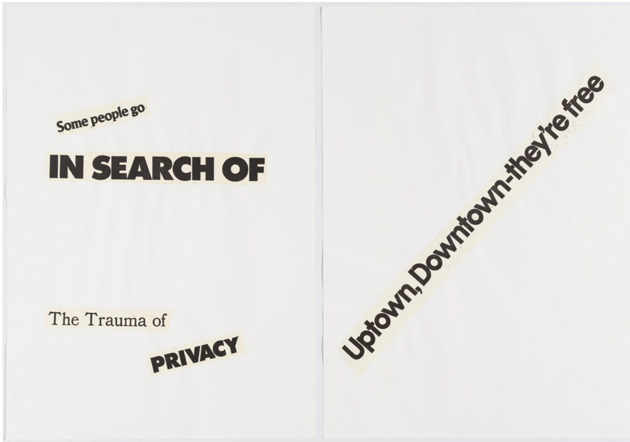
Lorraine O'Grady, Cutting Out CONYT 09 , 2018, letterpress printing on Japanese paper, cutout, collage on laid paper, 41¼ x 60 inches. Alexander Gray Associates.

©LORRAINE O'GRADY AND ARTISTS RIGHTS SOCIETY (ARS), NEW YORK/COURTESY ALEXANDER GRAY ASSOCIATES, NEW YORK