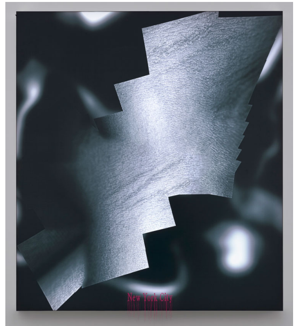
Seth Price, Untitled , 2015–18, dye-sublimation print on synthetic fabric, embroidery, aluminum, LED matrix, 80 x 90 x 4 inches. COURTESY THE ARTIST AND PETZEL, NEW YORK

I think a lot of the appeal had to do with the rich compositions and colors—or in some cases, lack of color. Take for example the two black-and-white LED light boxes involving photographic fragments of what I assumed to be human flesh. They were already powerful enough, even without the words "New York City" embroidered down at the bottom in pink thread, with additional threads hanging below the edge of the support. What might have seemed arbitrary instead added to the mystery.