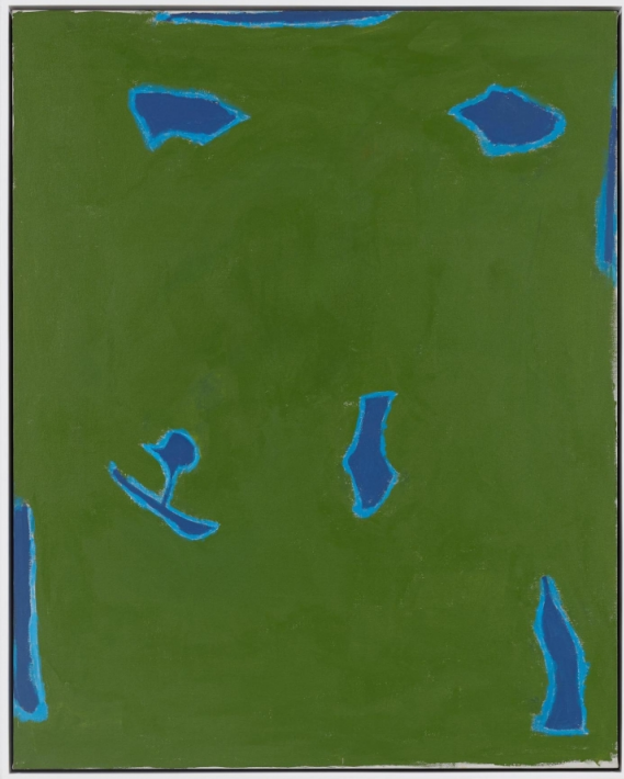
Betty Parsons, "Bird in a Boat" (1971), acrylic on canvas, 60.25 x 48 inches

And yet, she does something fresh and whimsical just a few years later in "Bird in a Boat" (1971). In this green painting populated by a handful of dark blue shapes edged with a light blue border, Parsons uses the title to call attention to a shape that looks like the silhouette of a cartoon bird sitting in a cartoon boat. While the title directs the way we read one particular shape in the painting, the others do not yield to our associative powers. I was unexpectedly reminded of Raoul de Keyser. "Maine" (1972) also has some of the same feeling, of abstract shapes based on something in reality, but you have no idea what.