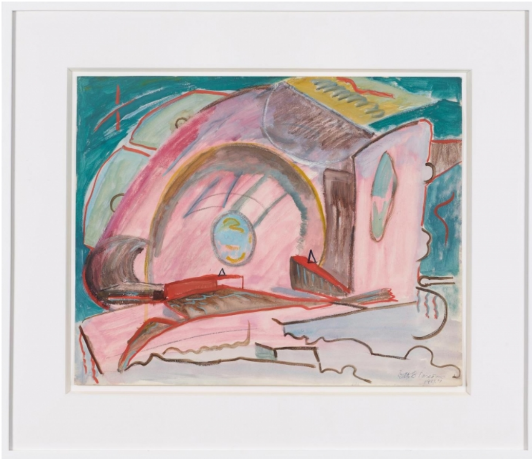
Betty Parsons, “The Circle” (1947), gouache on paper, 16 x 20 inches