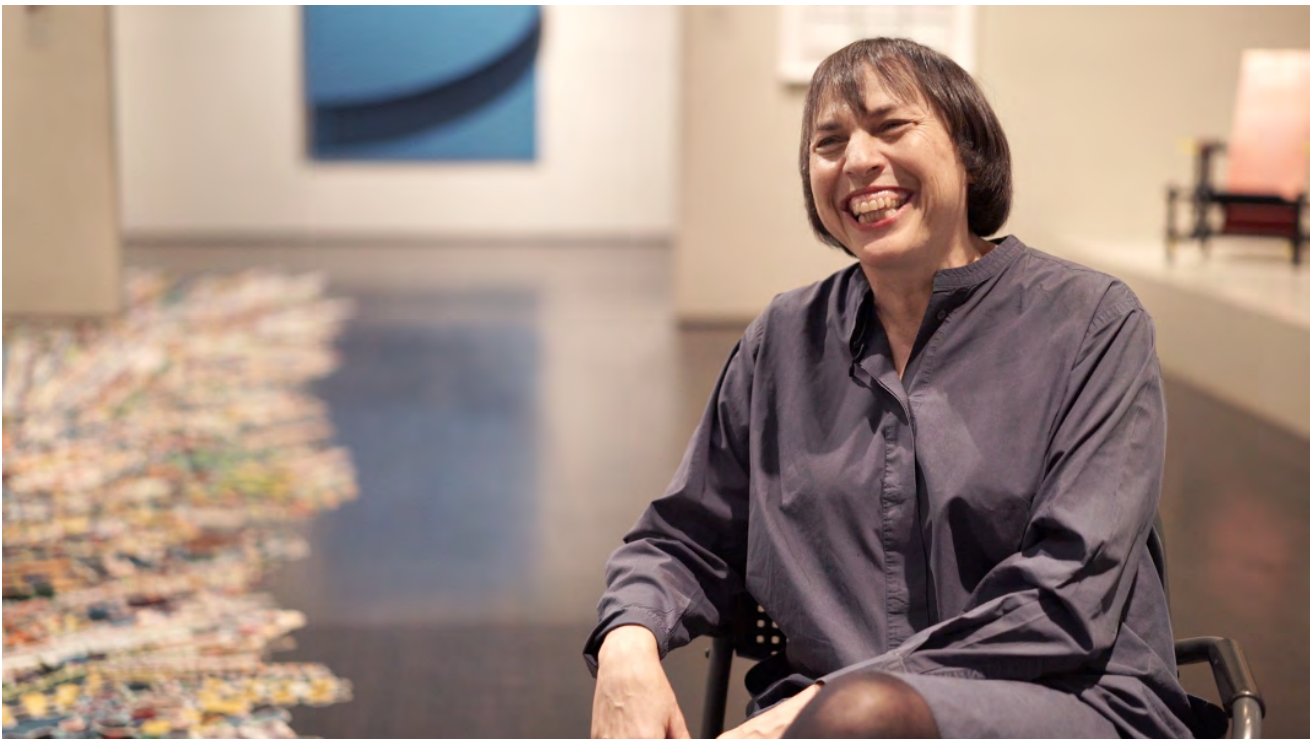
Artist Polly Apfelbaum at LACMA