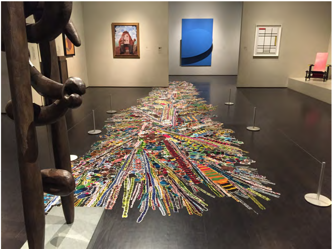
Polly Apfelbaum's favorite perspective for viewing Black Flag