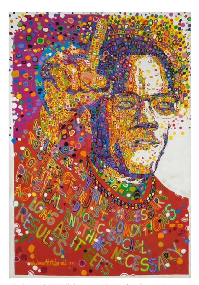
Wadsworth Jarrell (born 1929) Black Prince, 1971. Acrylic paint on canvas. Collection of Munson and Christina Steed, Atlanta © Wadsworth Jarrell,

"The powerful and provocative artworks on view in Soul of a Nation offer eloquent testimony regarding the singular power of art to confront might with right, to empower individuals and communities, and to inspire cultural pride and solidarity," notes Timothy Anglin Burgard, Curator in Charge of American Art at the Fine Arts Museums of San Francisco. "The core messages and meanings of these historical works retain their contemporary relevance and resonance, showing how far the nation has progressed, but also how many important issues still remain unresolved."