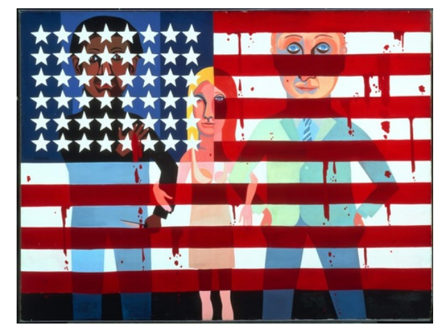
Faith Ringgold (born 1930) American People Series #18, The Flag Is Bleeding, 1967. Oil on canvas. 72 x 96 in. (182.9 x 243.8 cm) From the artist's collection. © 2019 Faith Ringgold / Artists Rights Society (ARS), New York, Courtesy ACA Galleries, New York / Photo courtesy of Faith Ringgold / Art Resource, NY

Commencing in 1963, the year of the March on Washington and in the height of the Civil Rights Movement, the exhibition examines the impact of key historical events, and diverse cultural influences including music and literature. Galvanized by the spirit of the times, and the struggle for equality and justice, many artists created images that promoted individual and collective strength, solidarity, and resistance. The call for Black Power generated powerful representational images of political leaders such as Wadsworth Jarrell's Black Prince (1971) [Malcolm X], and John Outterbridge's About Martin (1975) [Dr. Martin Luther King, Jr.], who were fighting for equality and justice. Reclaiming the African roots of abstraction from European and American modernists, artists, such as William T. Williams and Joe Overstreet focused primarily on color, form, and concept. Photographers such as Roy DeCarava depicted the diversity, complexity, and beauty of ordinary African Americans, trying to live their lives in the midst of a racist society. Together their art changed the face and future of America.