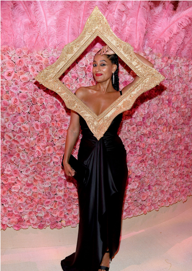
Tracee Ellis Ross at the 2019 Met Gala.

Susan Sontag's 1964 essay "Notes on 'Camp'" was the apt (though somewhat heady) theme for last night's Metropolitan Museum of Art Costume Institute gala, a.k.a. the Met Gala. Sontag's essay opens as follows: