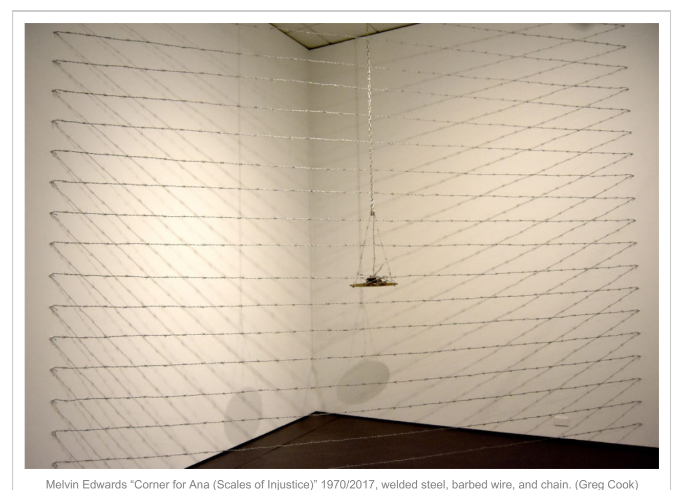
Melvin Luwards Comer for Aria (Goales of Injustice) 1970/2017, weided steel, barbed wire, and chain. (Greg Good

"The series contextualizes the police brutality that was rampant in the city within the large American history of violence against African-Americans of which lynching was emblematic," Kellie Jones wrote in the catalogue to the 2012 exhibition "Now Dig This! Art & Black Los Angeles 1960-1980."