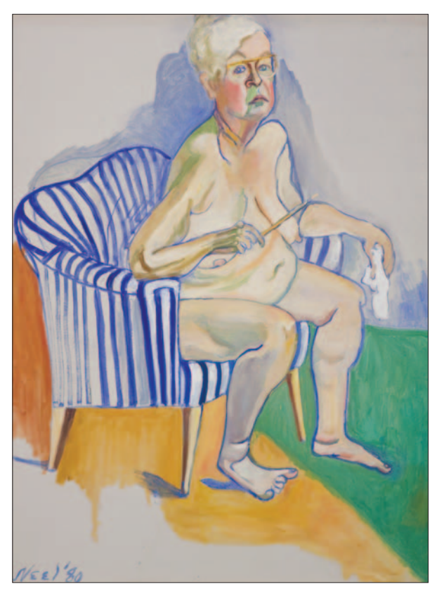
Alice Neel reveals herself in Self-Portrait, 1980, naked and nonchalant.

target demographic of 18 to 49. Nonetheless, youth is still beauty.