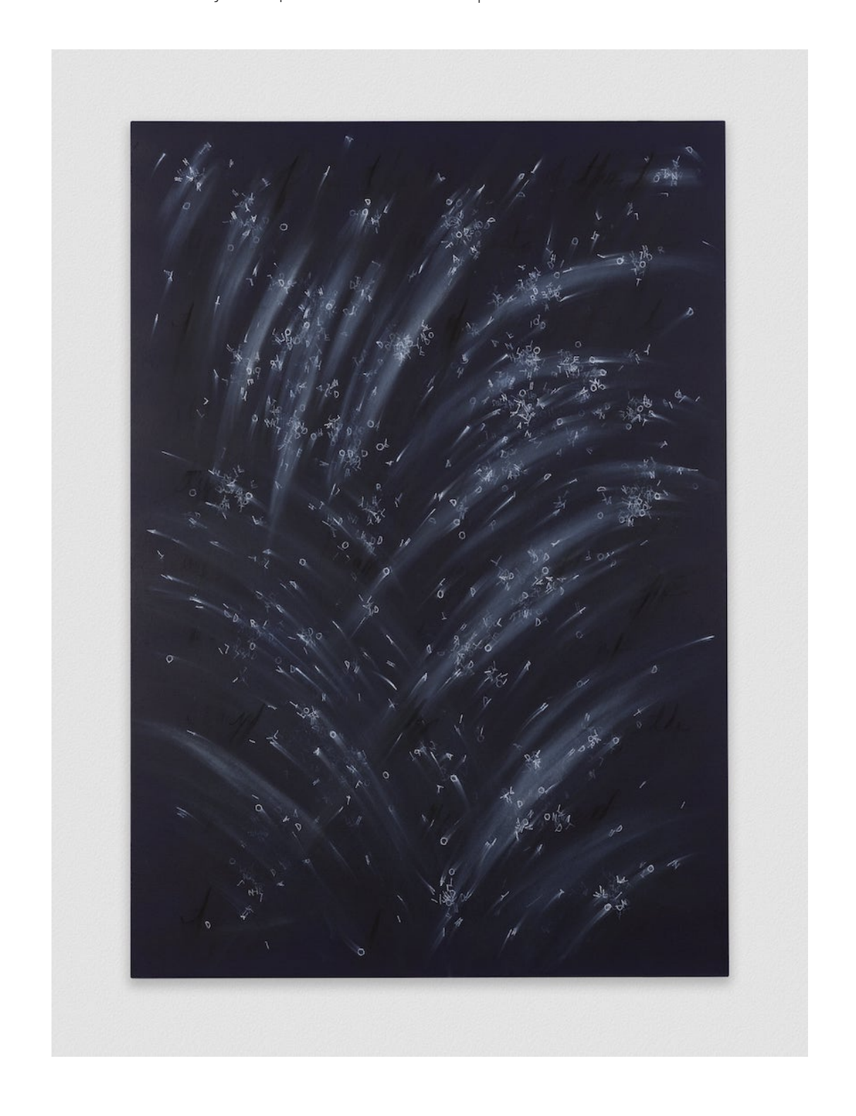
Land of the tyrant The Star Spangled Banner series, 2022 Charcoal and acrylic on panel 46" x 32" x 2" | 116.84 x 81.28 x 5.08 cm BC239